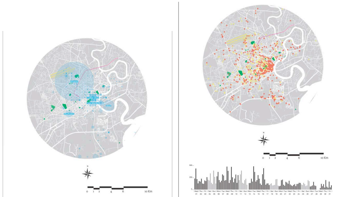
Figure 3. Ho Chi Minh City. Venues listed in Foursquare. Circle radius visualizes the relative popularity among users. Figure 2. Ho Chi Minh City. Geo-localized content shared on Twitter during the month of August 2012. In red are tweets written in Vietnamese.