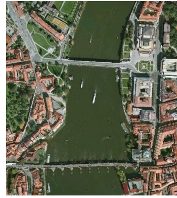
Vltava River and Charles Bridge