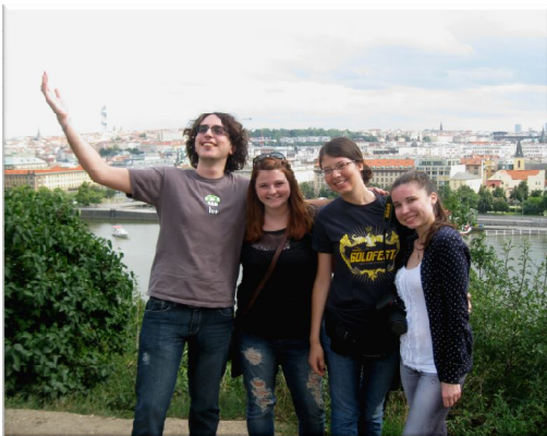
Participants from Summer Workshop 2012