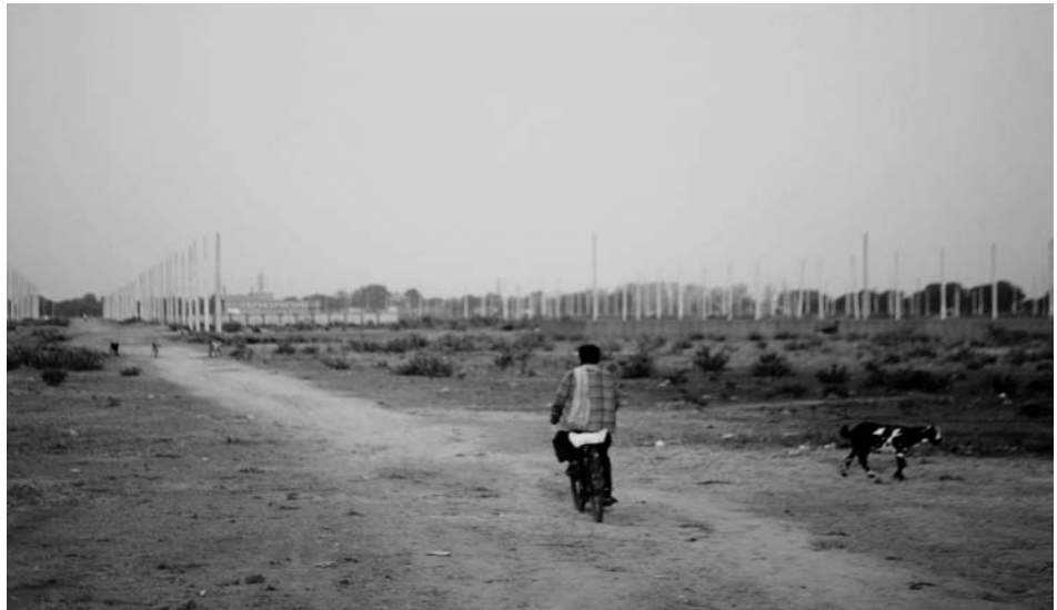
Picture 9. Empty space in the resettlement colony