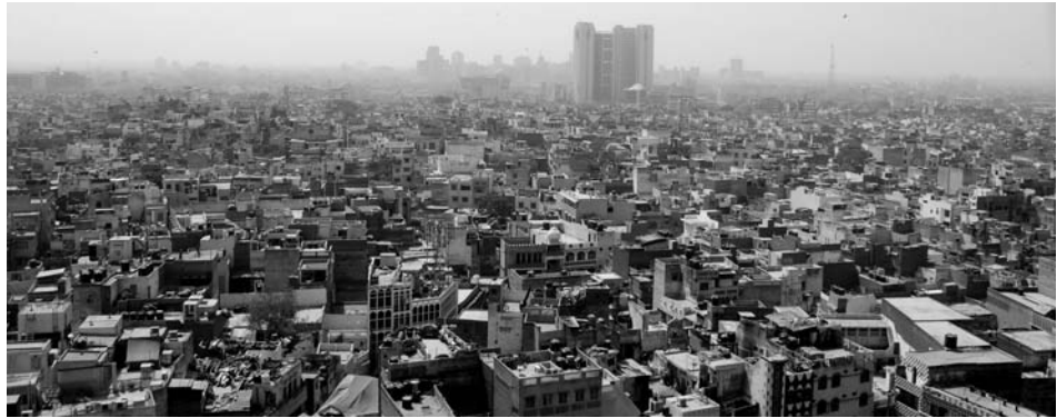
Picture 1. View of the city of Delhi

Delhi is usually said to be a city that came out from nowhere, a big metropolis with no past and with an uncertain future, without a coherent historic identity that characterize it. It is a very ancient territory, populated since the middle ages of the sultanate, when it had already been the location of seven ancient Moghul cities, and represented an important crossroads for merchants and migration flows. Delhi conquered his role of capital only at the beginning of the 20 th century when, for political reasons, Indian capital was moved there from Calcutta.