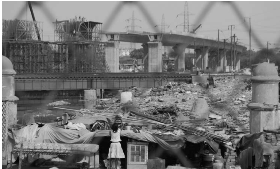
Picture 8. Pre-Commonwealth Games works in progress