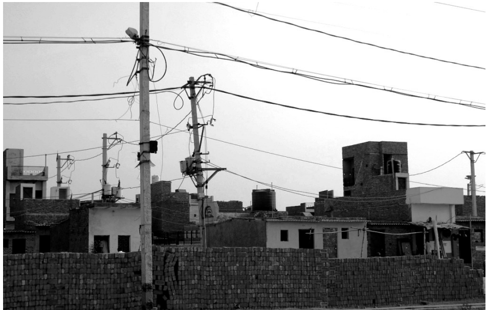
Picture 10. Resettlement colony