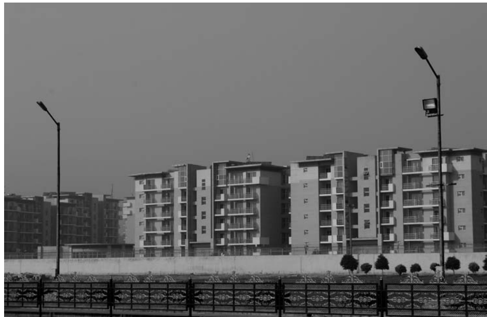
Picture 6. Athletes village, commonwealth Games 2010

There is a big debate about this, as the two following interviews witness, with different and sometimes contrasting accents. Debate that agrees with the fact that Delhi still resists to the globalization attacks, thanks to the strength of its citizens: it seems, in fact, that the capability to resist to global transformations is one of its aces in the hole for the future.