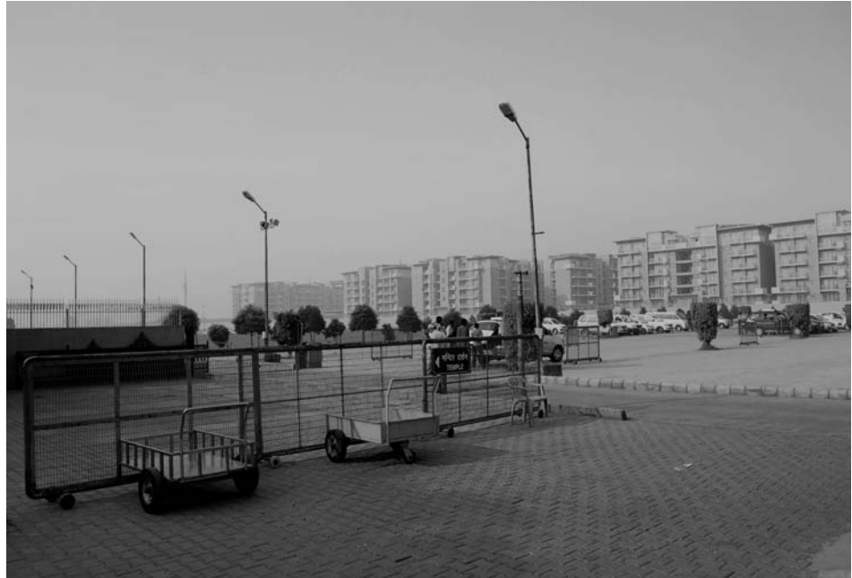
Picture 7. Athletes village, commonwealth Games 2010