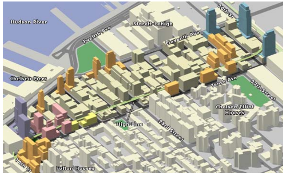
Figure 1: West Chelsea District, Highline Project, New York City.

in the Highline-case. In that case compensation is even a little more complicated because the land was rezoned so that the development rights could be sold but could also be used on site. In that case the building has to be constructed over the highline (see Figure 1).