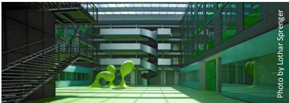
TU Dresden – Excellence University