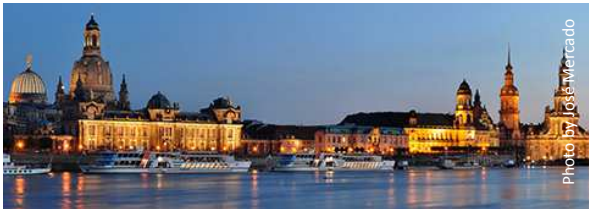
Dresden Historical City Center

SynCity2014 takes place in Dresden, one of Germany's most beautiful cities. In 2012, Technische Universität Dresden has been awarded the title 'Excellence University', thus indicating it as one of the leading German universities. Venue of the summerschool is the Department of Architecture on the main campus of the university,.