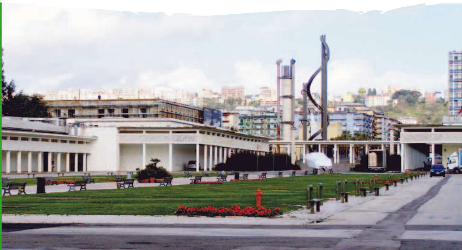
Mostra d' Oltremare

The Forum will be held at the Mostra d' Oltremare centre in the west of the city. See http://www.mostradoltremare.it